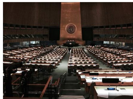
General Assembly Chamber, United Nations Headquarters.