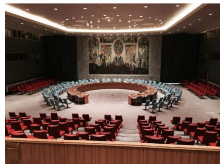
Security Council Chamber, United Nations Headquarters.

On an unseasonably warm and sunny December day, I joined 50 men and women from around New York state and Canada for "League Day" at the United Nations. League Day is a wonderful perk of being a LWV member because it entitles you, for a modest fee, to attend two UN briefings on current topics; these briefings are not open to the general public.