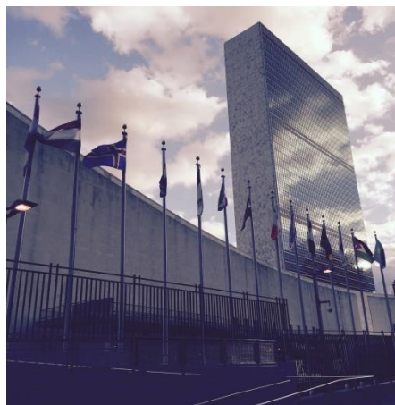
United Nations Headquarters, New York City.