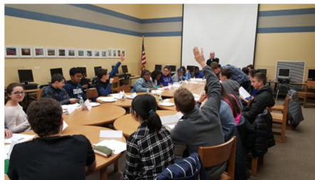
Youths from local high schools at this season's first meeting of "Tools for Change".

The Tools for Change Seminar welcomed a record number of students to its first meeting on December 7, 2015. Thirty-two students came from Blind Brook, Rye Neck, and Port Chester High Schools and represented a wide range of talents and perspectives from the community.